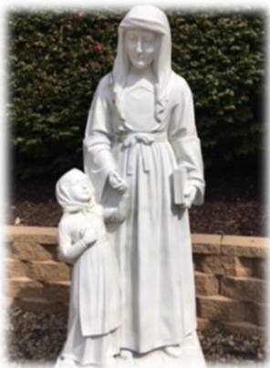
St. Louise de Marillac, Pray for Us

Please let us know about any other alumni and their achievements. It would be great to recognize their success in a future newsletter.