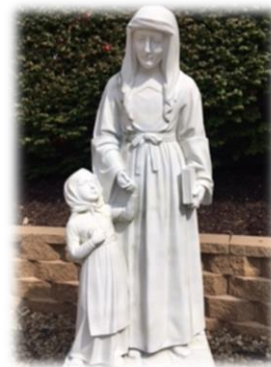
St. Louise de Marillac, Pray for Us