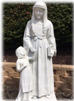
St. Louise de Marillac--Pray for Us!