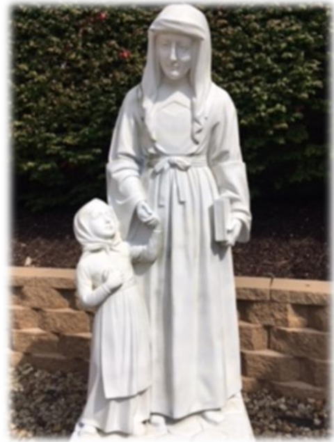
St. Louise de Marillac, Pray for Us!

COUNT YOUR BLESSINGS. NAME THEM ONE BY ONE. COUNT YOUR MANY BLESSINGS SEE WHAT GOD HAS DONE.